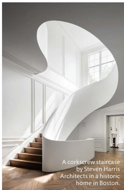
A corkscrew staircase by Steven Harris Architects in a historic home in Boston.